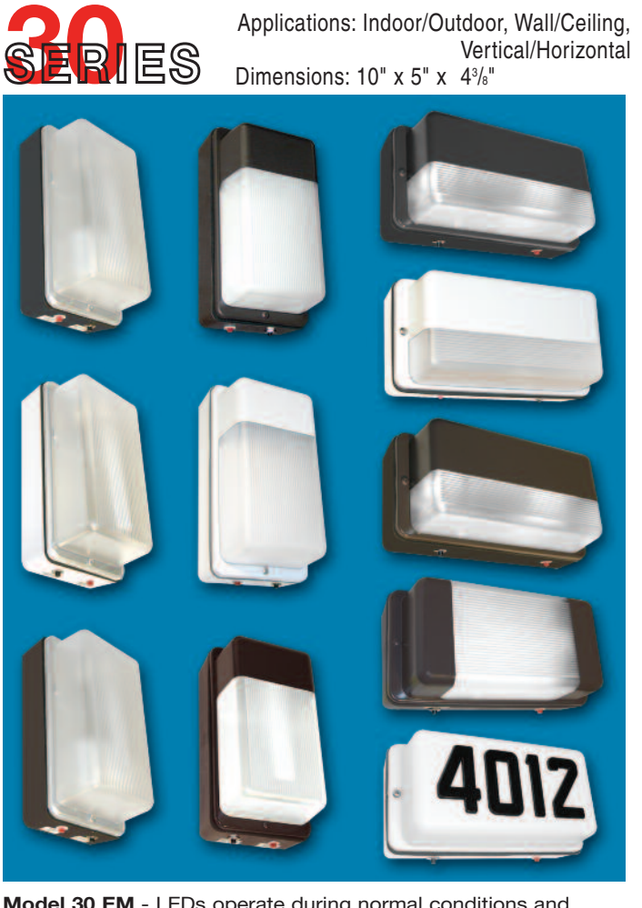
Model 30 EM - LEDs operate during normal conditions and operate during emergency conditions.